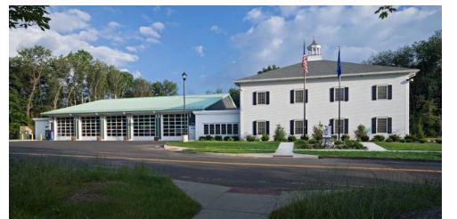
Fire HQ Woodbridge, CT 3 bays 20,000 SF $277.29/SF