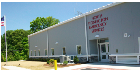
Emergency Services Center North Stonington, CT 4 double bays 12,000 SF $331.66/SF