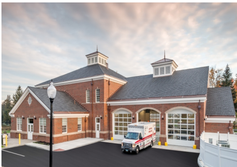
Ambulance HQ Newtown, CT 6 bays 14,500 SF $295.38/SF