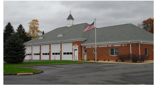
Volunteer Fire Co. Oxford, CT 5 bays 5,000 SF $69.90/SF