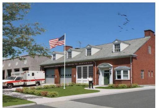
Emergency Medical Facility Headquarters Stratford, CT 9,500 SF $171.79/SF