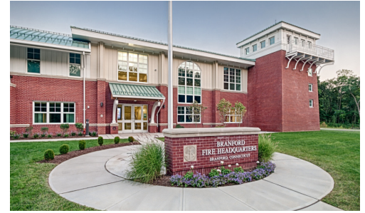
Fire Headquarters Branford, CT 4 bays 31,000 SF $339.29/SF LEED® Silver 2013 Station Style Design Award "Notable Mention"