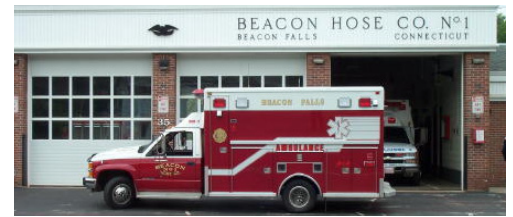
Beacon Hose Co. #1 Beacon Falls, CT 6 bays 14,000 SF $159.26/SF