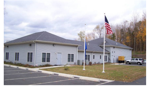
Ambulance HQ North Branford, CT 3 bays 7,500 SF $76.04/SF