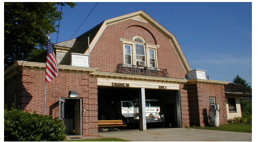
Fire Company #16 New Haven, CT 2 bays 5,200 SF $228.15/SF