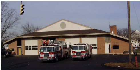
Fire House #2 Newington, CT 4 bays 10,000 SF $92.39/SF