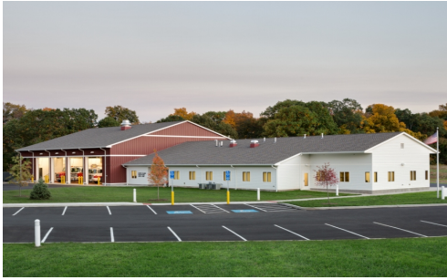
North Farms Volunteer Fire & EMS & Fire Dept. Station 7 Wallingford, CT 4 bays 14,800 SF $267.47/SF