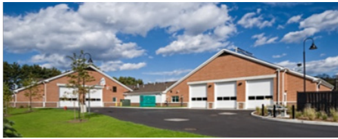
Fire Station No. 5 East Hartford, CT 3 bays 15,900 SF $340.50/SF LEED® Gold