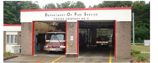
Foxon Fire Co. #3 East Haven, CT 2 bays 7,900 SF $45.57/SF