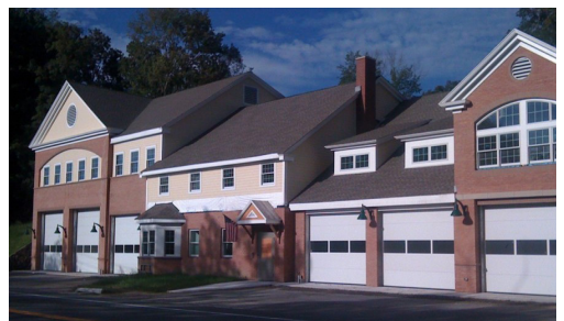
Firehouse Expansion Sherman, CT 6 bays 16,000 SF $226/SF