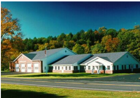
Fire House Washington, CT 4 bays 11,000 SF $90.90/SF