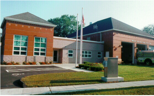
West Shore Fire Station Milford, CT 3 bays 11,129 SF $120.69/SF