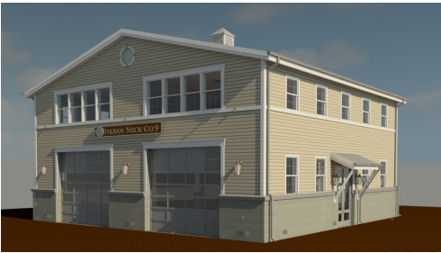
Indian Neck Fire Station Branford, CT 2 bays 5,000 SF $254/SF