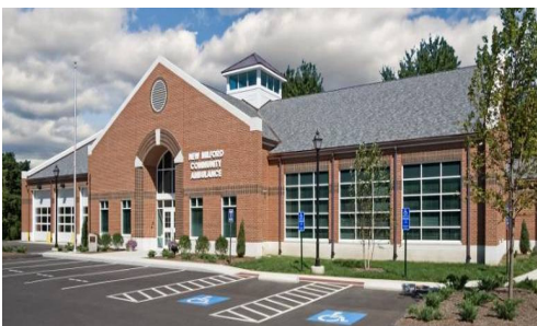
Ambulance HQ New Milford, CT 3 bays 11,009 SF $228.00/SF