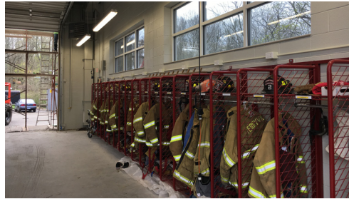
Terryville Fire Station #2 Expansion, Plymouth, CT 2 bays 10,000 SF $320//SF