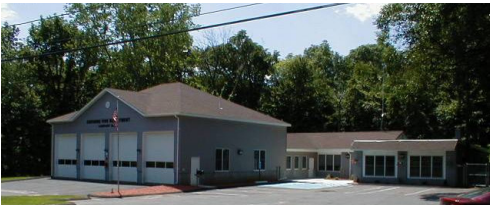
Fire House #2 Cheshire, CT 4 bays 6,800 SF $95.58/SF