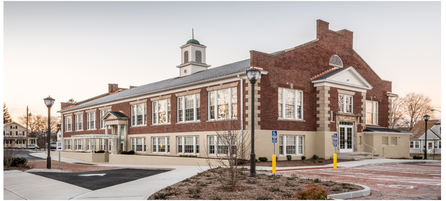
▲ Library/Reading Room at Middletown Senior Center (c. 1929) Middletown, CT Restoration and rehabilitative reuse and addition; 13,000 s.f., $5 million