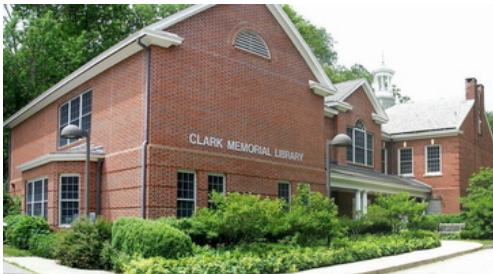
▲ Clark Memorial Library, Bethany, CT Energy Efficiency Improvements