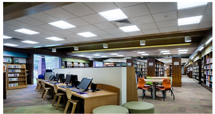
▲ Bishop's Corner Library, West Hartford, CT Renovations