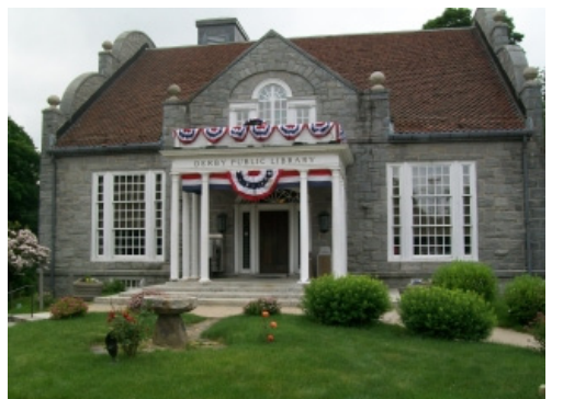
▲ Derby Public Library (c. 1902), Derby, CT Facility needs assessment, water infiltration, masonry repairs