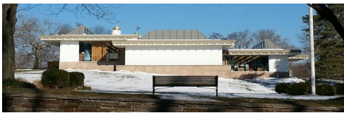
▲ Kent Memorial Library, Suffield, CT Roof Replacement & Renovations