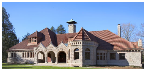
▲ Pequot Library (c. 1889), Southport, CT M/E/P Engineering Design Services