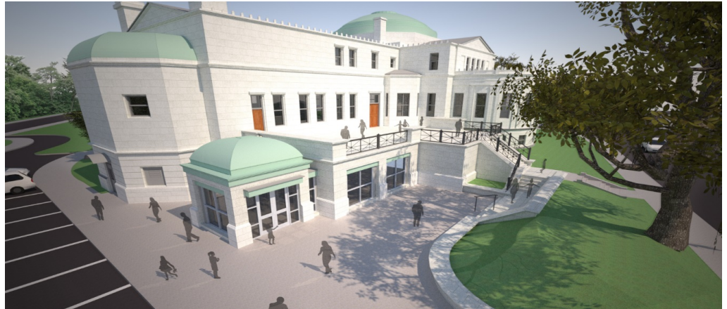
▲ James Blackstone Memorial Library (c. 1896), Branford, CT New entrance & lobby, interior renovations, mechanical improvements; 26,000 s.f., $5 million

Design Resources. S/P+A is supported by leading edge computing and workplace technology. Advanced 3D technologies such as Revit, are fully integrated in house to enhance both design and construction.