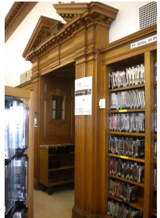
▲ Whiton Memorial Library (c. 1895) Manchester, CT Capital Needs Assessment