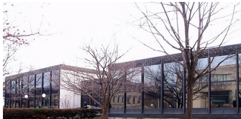
▲ Silas Bronson Library, Waterbury, CT Interior Renovations