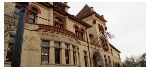
▲ Westerly Public Library (c. 1894), Westerly, RI Modification of M/E systems related to program changes within the library; 50,000 s.f., $4 million