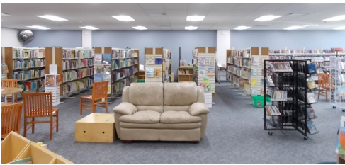
▲ Willimantic Public Library, Windham, CT Interior Renovations