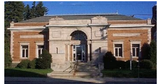
▲ Bugbee Memorial Library (c. 1902) Killingly, CT Facility condition assessment, roof/parapet repairs