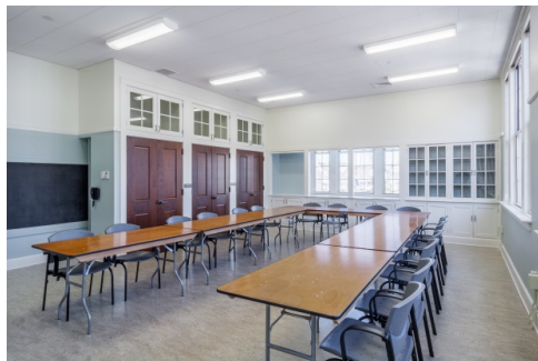
Small Meeting Room