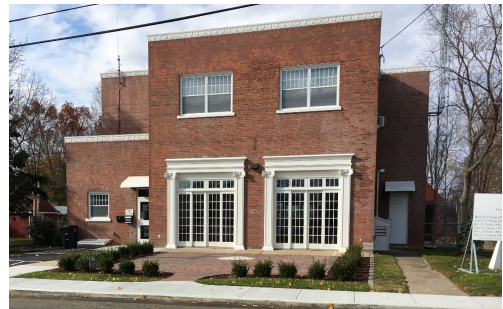
▲ Woodmont Borough Hall, Milford, CT 2,185 s.f. adaptive reuse; $1 million