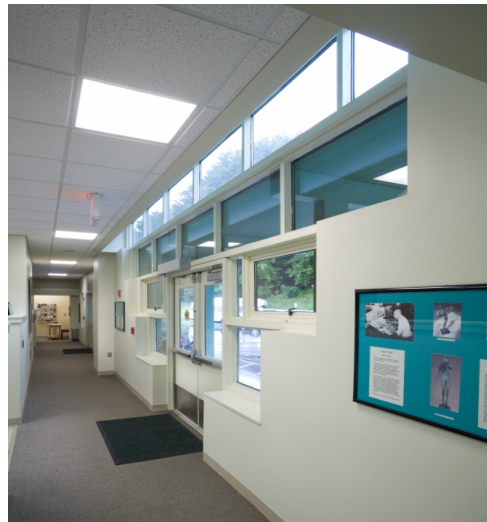
▲ Senior Center, Southbury, CT 17,000 s.f. renovation/expansion; $1.5 million