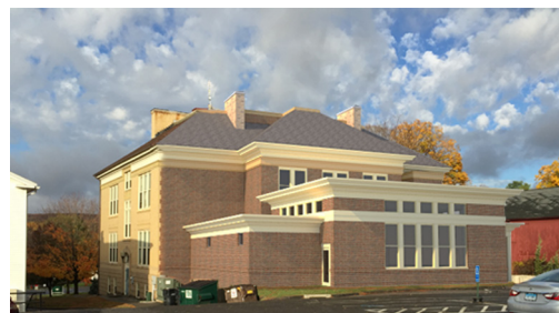
▲ Richmond Senior Center, New Milford, CT 1,890 s.f. addition; $545,000 (under construction)