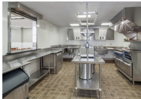
Full Commercial Kitchen